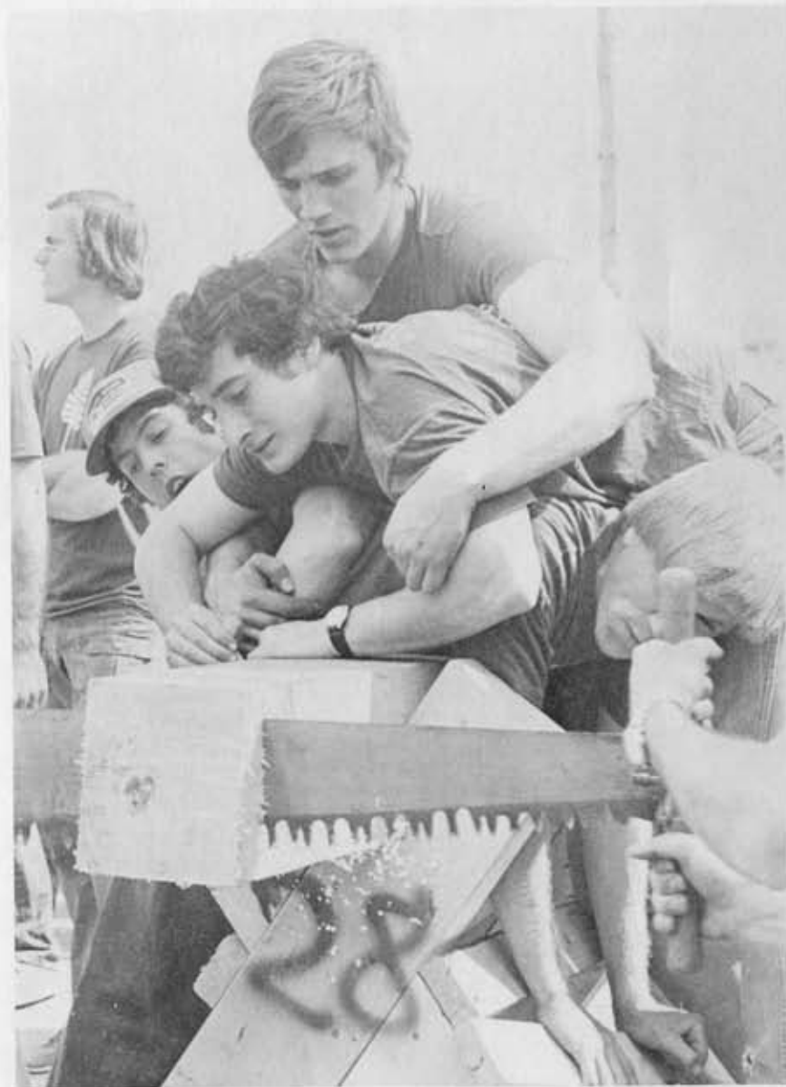
The A team puts some weight onto their cross-cut sawing cant.